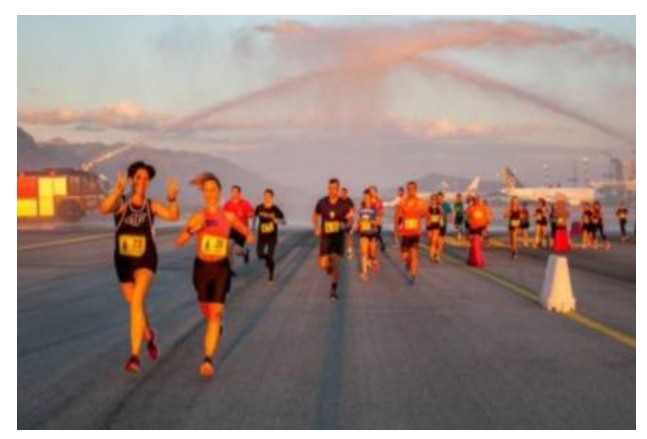
March 2025 RUNWAY RUN https://du-motion.com/hr

Exciting and extraordinary. A running spectacle that will make your heart fly.