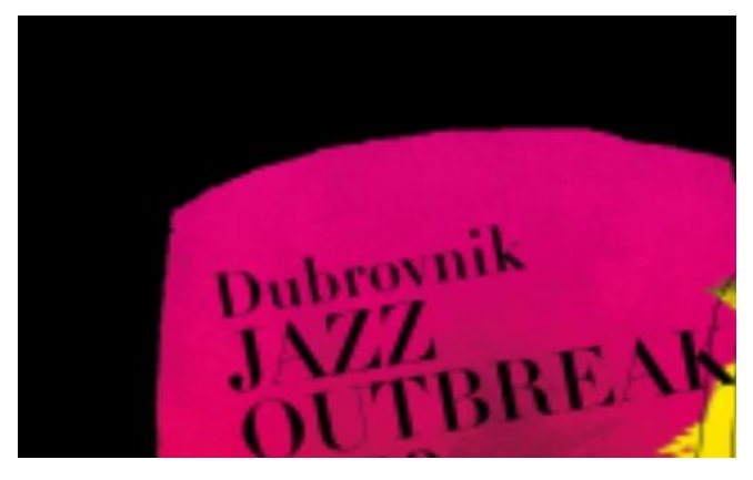
November 2025 DUBROVNIK JAZZ OUTBREAK 2025 www.dubrovackabastina.com

The Dubrovnik Jazz Outbreak festival is a unique event that takes place in the beautiful city of Dubrovnik. The festival brings together talented jazz musicians to provide live music experiences for attendees. Visitors will have the opportunity to listen to a variety of jazz styles, from traditional to modern, and enjoy the ambiance of this beautiful city. Don't miss the chance to be a part of this memorable musical event and experience the great atmosphere of the Dubrovnik Jazz Outbreak festival.