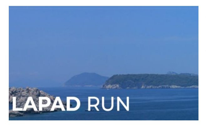
September 2025 LAPAD RUN https://du-motion.com/hr

Autumn running treat with an admirable goal. An ideal combination, isn't it?!