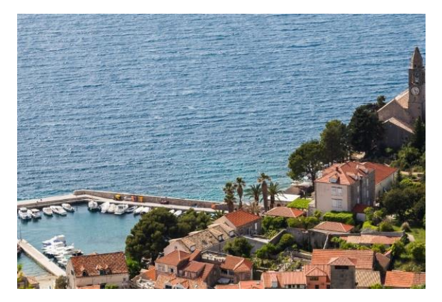
June 26 – 28, 2025 PONTA LOPUD FILM FESTIVAL <u>https://pontalopud.hr/about-the-festival-copy/</u>

Ponta Lopud" is a creative hub where film professionals will have an opportunity to gain new experiences and create long-lasting professional relationships and friendships.